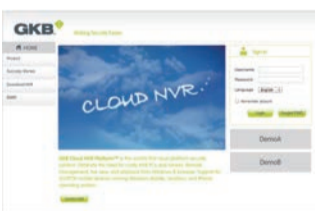
GKB Cloud NVR Platform

To control and manage all areas of multiple branches, GKB Cloud platform provides a range of unique features, combining high performance with simplicity of operation and intuitive interface and scaling management. Making Highlands Coffee Security Easier.